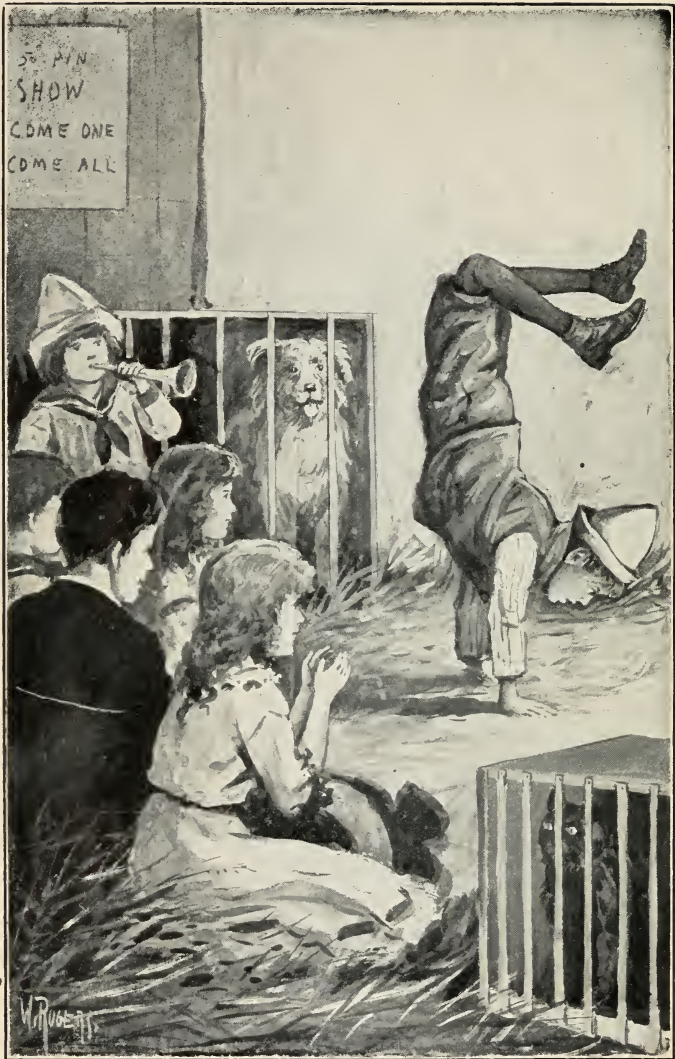
BURT WAS VERY FUNNY AS A CLOWN, AND HE TURNED SOMERSAULTS IN THE HAY.